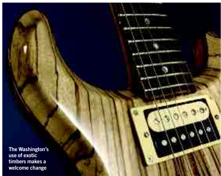
The Washington's use of exotic timbers makes a welcome change

Like many makers in their early years, Paul has yet to settle on a specific style – he’ll make just about anything – but this Washington outline caught our eye with its seventies vibe. Using a neck-through construction of quarter-sawn mahogany with a small central zebrano fillet, the body wings are slab-cut mahogany. The guitar is topped – it’s pretty much half the thickness of the body – with this natural finished and highly stripy book-matched zebrano. The top isn’t carved like a violin, but has a sloping edge chamfer that at the tip of each horn becomes a little more rounded. The koa